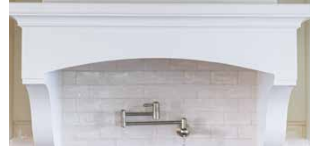
22 cottages & bungalows | cottagesandbungalowsmag.com