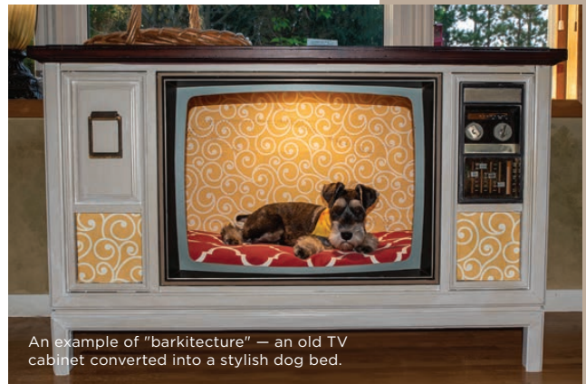
An example of “barkitecture” — an old TV cabinet converted into a stylish dog bed.